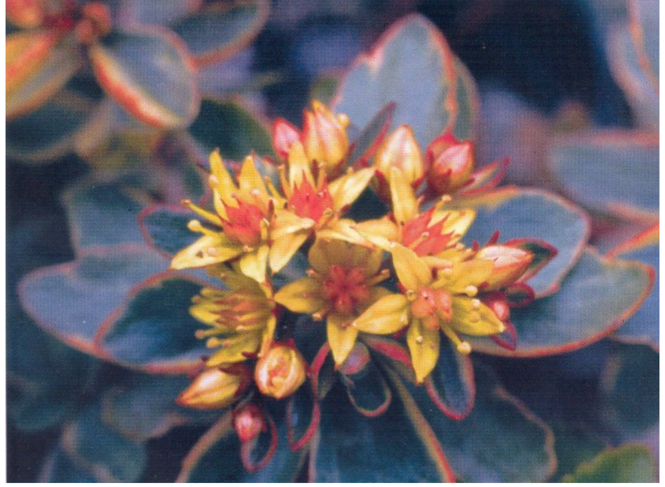
Figure 5 This variegated form of Phedimus kamtschaticus has been in cultivation many years