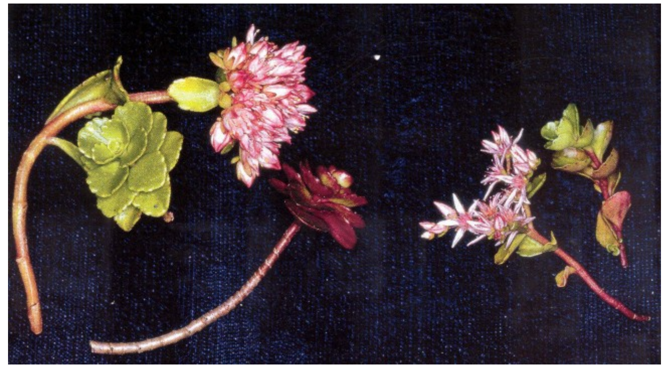
Figure 4 Phedimus spurius (left) and P. stoloniferus are regulary confused. Most forms of the former have larger leaves but the latter has narrow, spreading petals and spreading fruit.