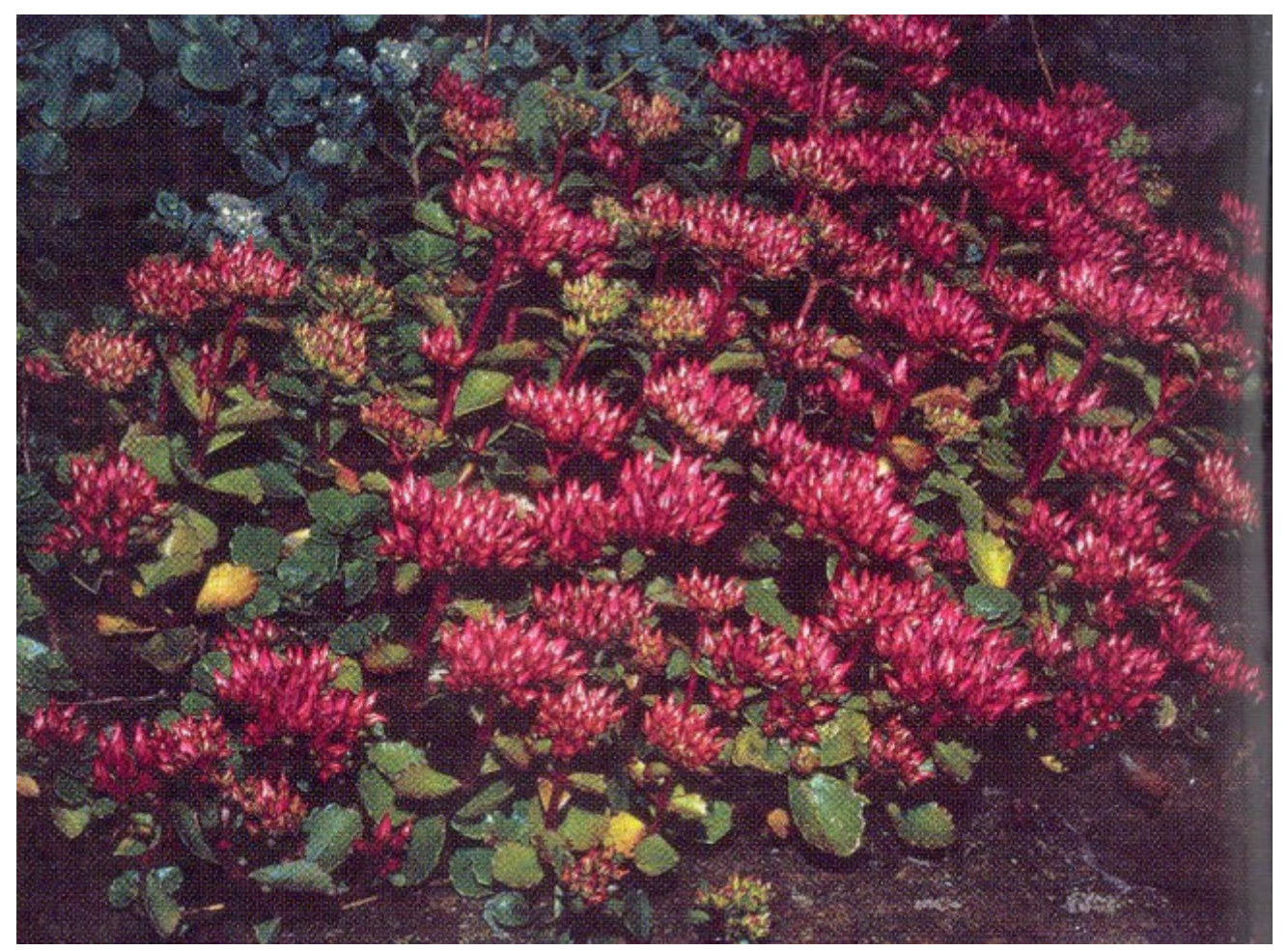
Figure 2 Phedimus spurius is mostly used as ground-cover. Here 'Fulda Glut' is seen in June.

Throughout my life, lack of space in the greenhouse has prompted me to place succulents outdoors in summertime for as long as possible. I have always been envious of those living in areas mild enough to make possible the permanent planting of succulents outdoors. The purpose of this article is to share quarter of a century's experience of growing succulents outdoors in the equivalent of Zone 6 and knowing well that many of the species I am to discuss are hardy to Zone 3. By contrast, they are less likely to be successful in places as warm as Zone 8, but enthusiasts in these locales probably have a plethora of succulents in the landscape already.