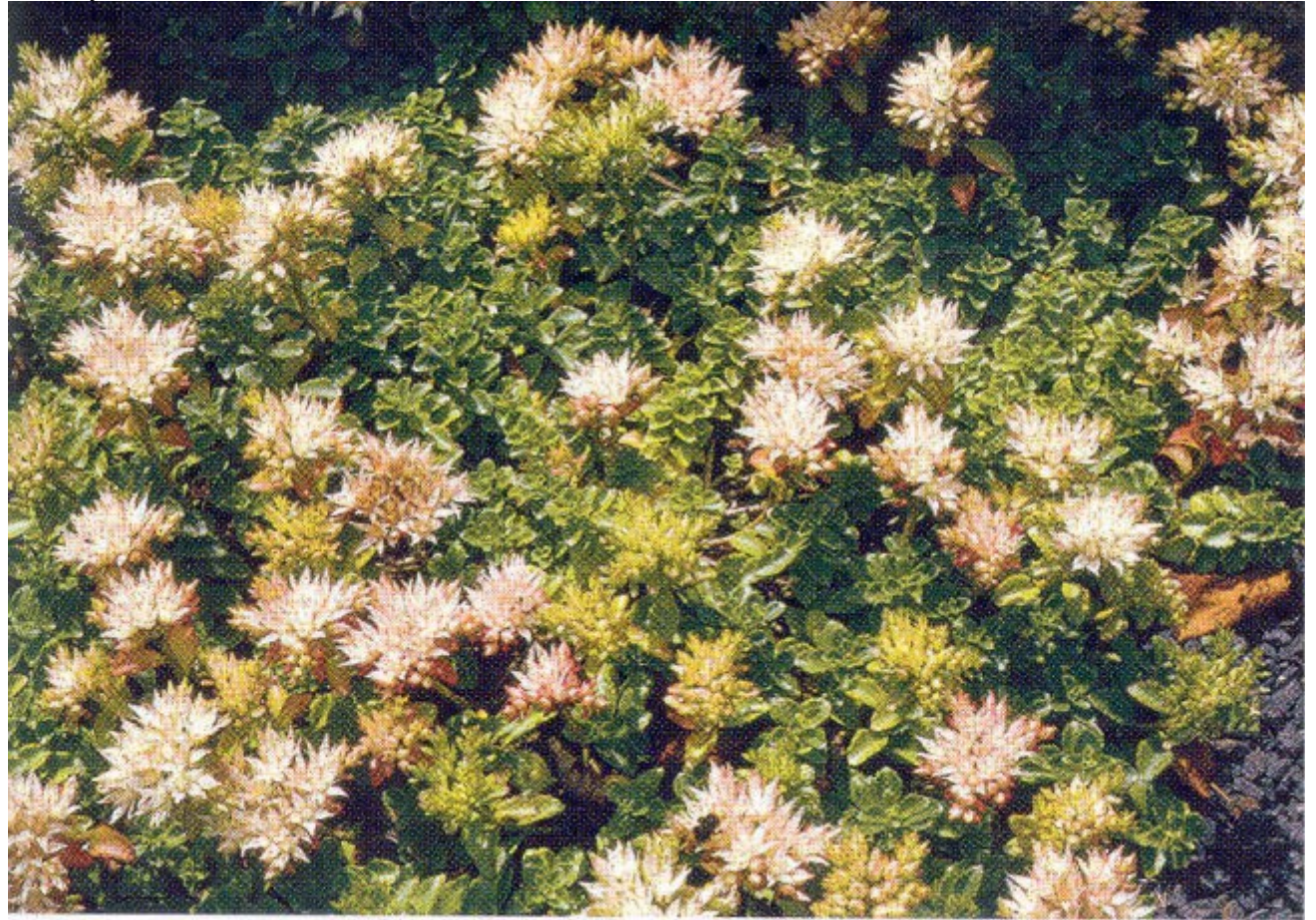
Figure 3 Phedimus spurius 'Leningrad White'.

5 Stephenson R, Harris JGS. 1991. How Sedum takesimense was introduced into cultivation. Sedum Society Newsletter 19: 4.